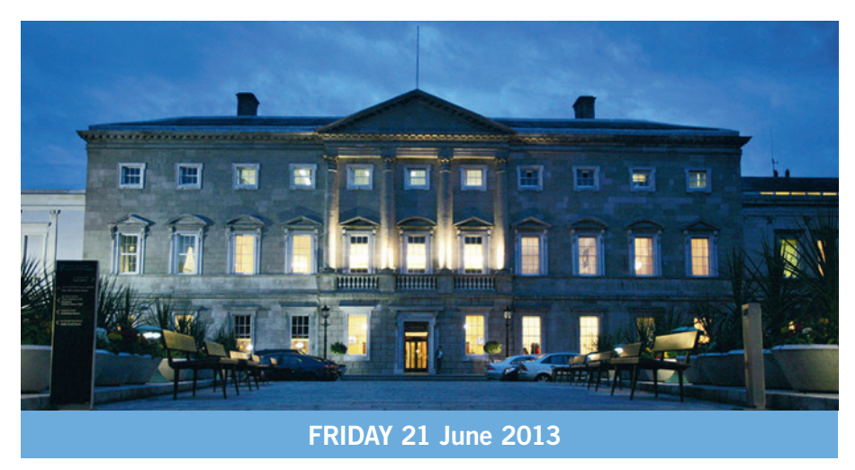
18:15 EUFORES Gala Dinner, Houses of Oireachtas (Irish Parliament)