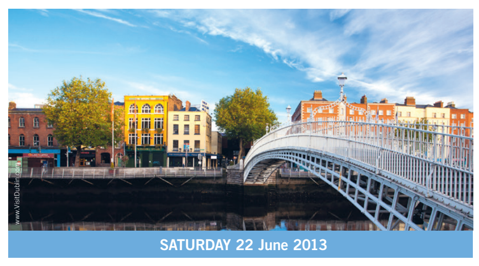
15:15 EUFORES IPM13 - Site Visits and Irish Traditional Dinner