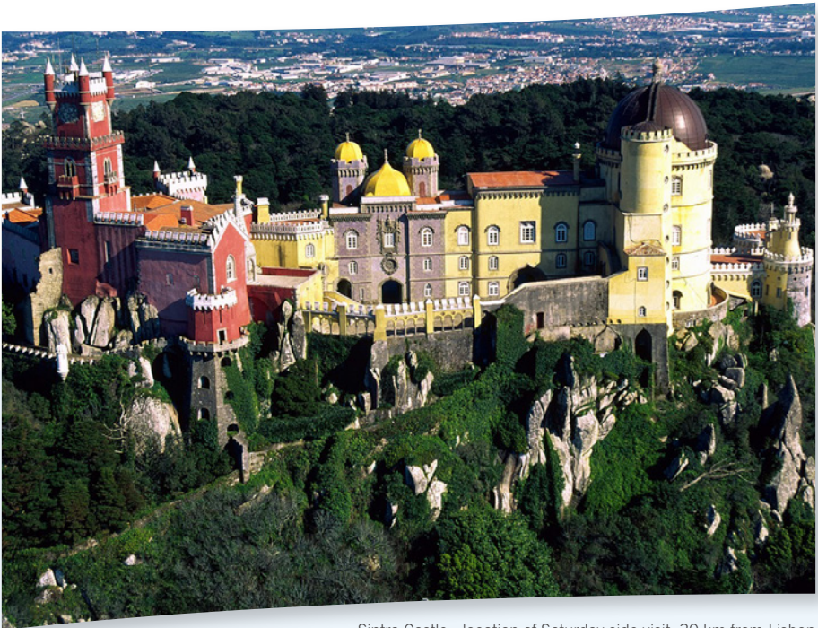
Sintra Castle - location of Saturday side visit, 30 km from Lisbon

21:30 Bus to Lisbon, two stops: Lapa Palace Hotel and Lisbon Centre Rossio Square at 22:30 latest