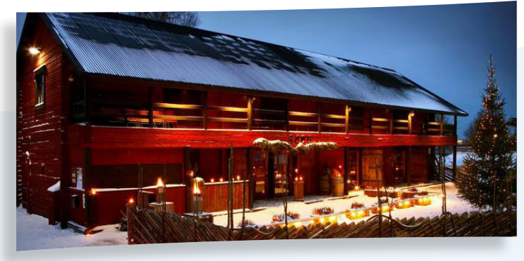
Savu Restaurant