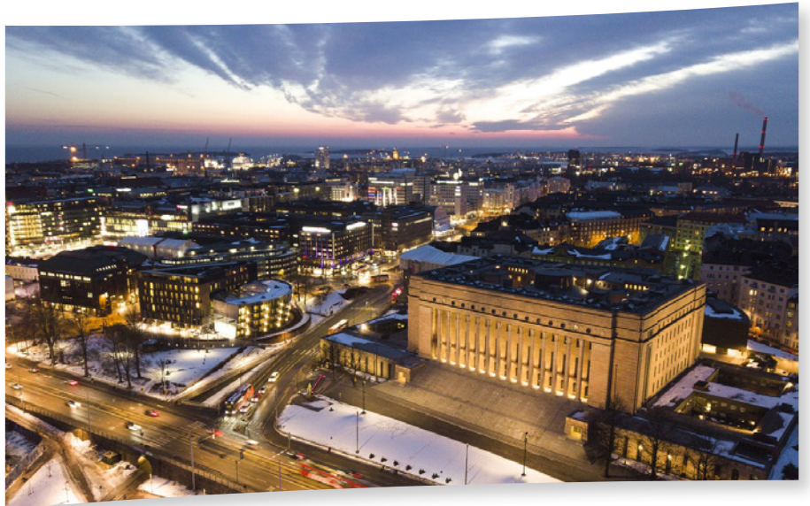
Finnish Parliament at night